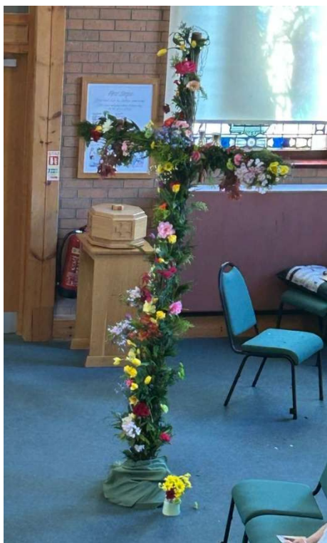
Woodley Methodist Church