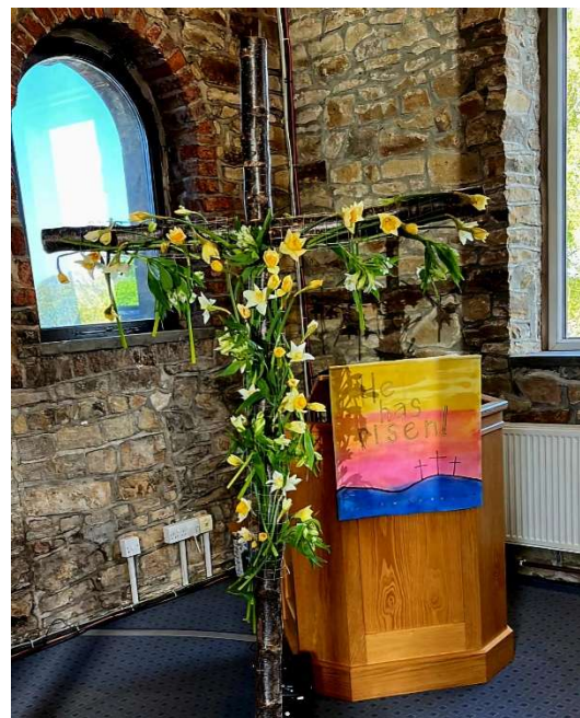
The Ridge Methodist Church