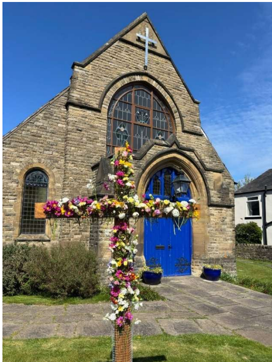
Windlehurst Methodist Church

We hope you all had a joyful Easter celebrating the resurrection of Christ our Saviour. Here are a few photographs of beautiful Easter crosses from around the circuit.